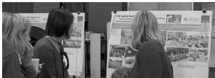
Live Oak residents share input on the proposed plans

In April , Dientes joined the County of Santa Cruz, MidPen Housing, and Santa Cruz Community Health Centers (SCCHC) in hosting two community meetings about our new 1500 Capitola Road project. Over 130 neighbors participated and provided feedback on the campus, which includes affordable housing by MidPen, a medical clinic operated by SCCHC and a 10-chair dental clinic for Dientes. As we continue to plan, we are excited to bring our vision of expanded access to care towards reality! Thank you to the Dientes donors, patients, board members, and staff who attended the meetings to show their support!